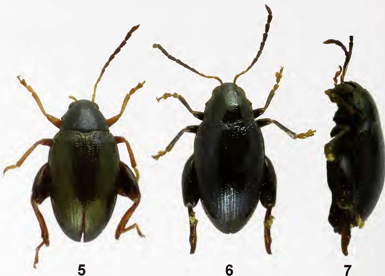
Figs 5–7. 5. Psylliodes viridana Motschulsky: lectotype; 6–7. Psylliodes yuae sp. n.: 6. dorsal view; 7. lateral view.

16.VII.2007, leg. M.-H. Tsau, 1 ex. (TARI). Hsinchu County . Taiwan: Hsinchu, Talulintao, 17.II.2008, leg. M.-H. Tsao, 12 exx. (TARI); Taiwan: Hsinchu, Feifengshan, 05.III.2009, leg. S.-F. Yu, 6 exx. (TARI); Taiwan: Hsinchu, Hsinfeng, 31.III.2009, leg. S.-F. Yu, 4 exx. (TARI); Taiwan: Hsinchu, Wufeng, 17.II.2009, leg. S.-F. Yu, 1 ex. (TARI); Taiwan: Hsinchu, Paoerhshuiku, 04.XII.2008, leg. S.-F. Yu, 1 ex. (TARI).